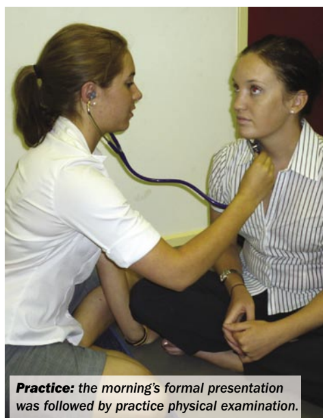
Practice: the morning's formal presentation was followed by practice physical examination.