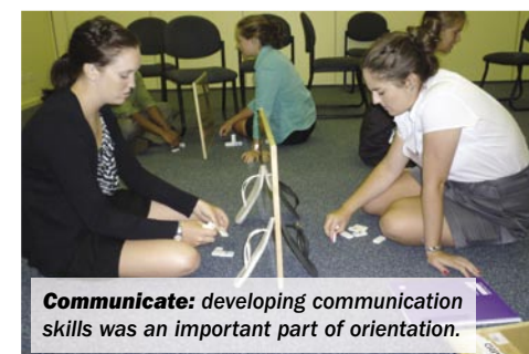
Communicate: developing communication skills was an important part of orientation.

The University of Melbourne Semester 8 ERC students, who have been in Bendigo since July last year, assisted