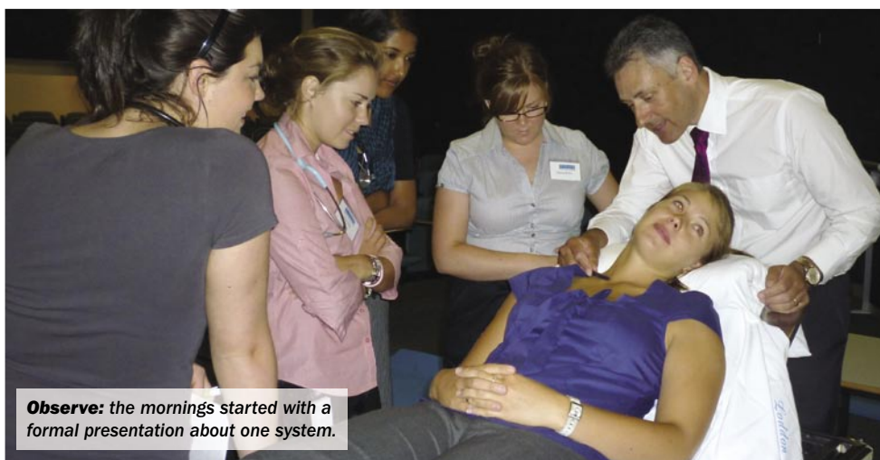
Observe: the mornings started with a formal presentation about one system.

In the past, students have undertaken skills orientation gradually over the commencement of their hospital clinical year. This year their orientation featured working through one of the basic systems each day: cardiovascular, respiratory, gastrointestinal and neurological. This new structure is very important as it then forms the foundation of physical examination skill development for the remaining years of the student's medical training.