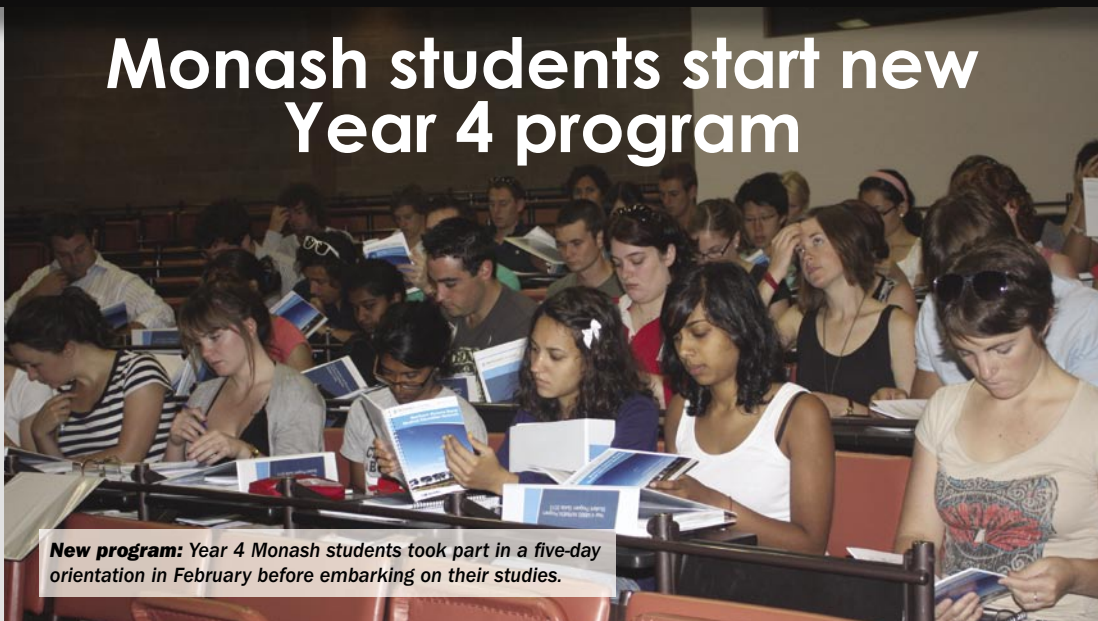
New program: Year 4 Monash students took part in a five-day orientation in February before embarking on their studies.

Where do you put 38 Monash University Year 4 students for a week of orientation in Bendigo? At La Trobe University of course. The new north-west Year 4 program brings all students together for a week at the beginning of each semester. They then disperse to the clinical schools in Mildura, Bendigo, or one of three rural hubs from Swan Hill down to Woodend for the rest of the semester.