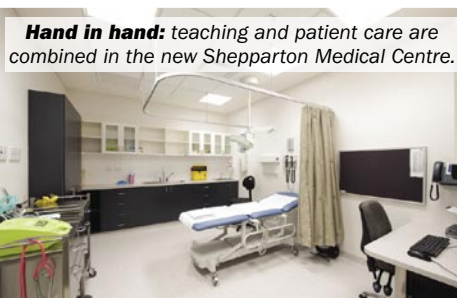
Hand in hand: teaching and patient care are combined in the new Shepparton Medical Centre.

Recruitment of sufficient staff, dedicated to teaching as well as clinical service, is key to the clinic's success. A good start has been made, but it will take time to recruit sufficient suitable staff to reach full capacity. Another key to success is the willingness of patients to participate in student education. Over the past eight years patients attending Goulburn Valley Health and other health service providers in the Goulburn Valley community have clearly demonstrated their willingness to contribute to student teaching we look forward to this continuing at Shepparton Medical Centre where teaching and patient care go hand in hand.