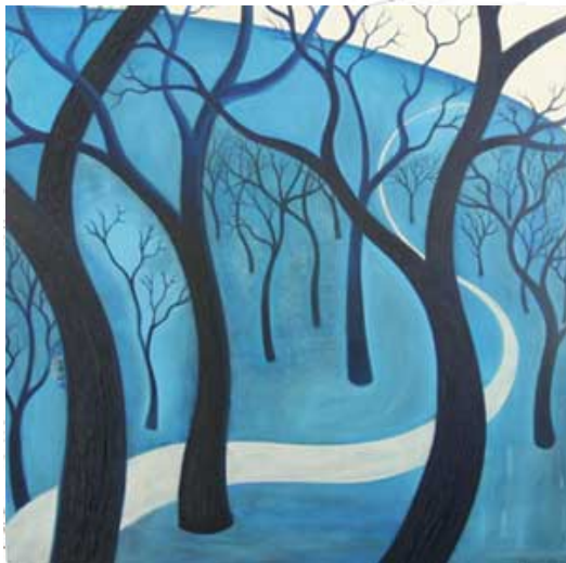
David Rellim Shadowed Sorrow 2007-8. Oil on canvas 76.2 x 76.2 cm

Two new art collections will be shown from the 9 April.