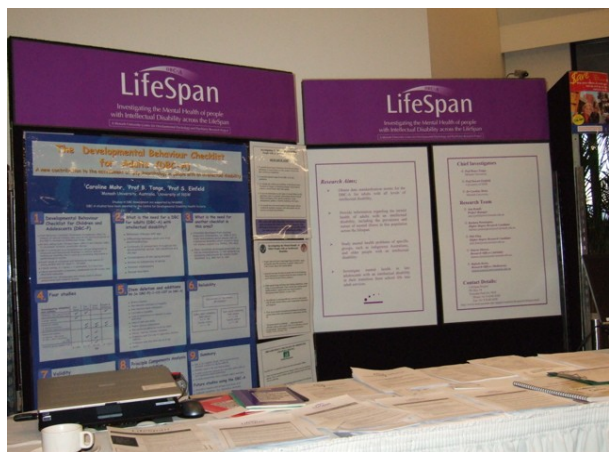
Above; LifeSpan Display IDSC Conference

If they need help or have questions about the research or the process please get them to give us a call as we need as many people as possible to be a part of this great opportunity