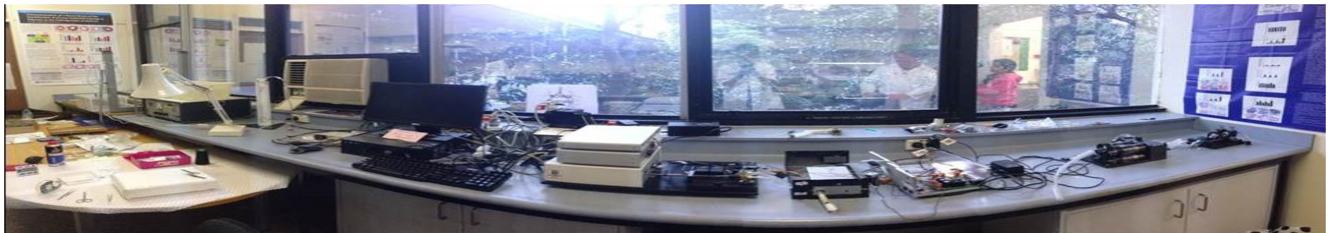
Lung function testing equipment