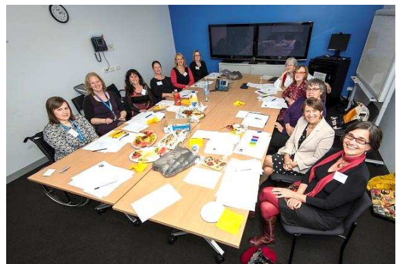
Above: Research team and expert panel meeting

Note: Support for this project has been provided by the Australian Government Office for Learning and Teaching. The views in this project do not necessarily reflect the views of the Australian Government Office for Learning and Teaching