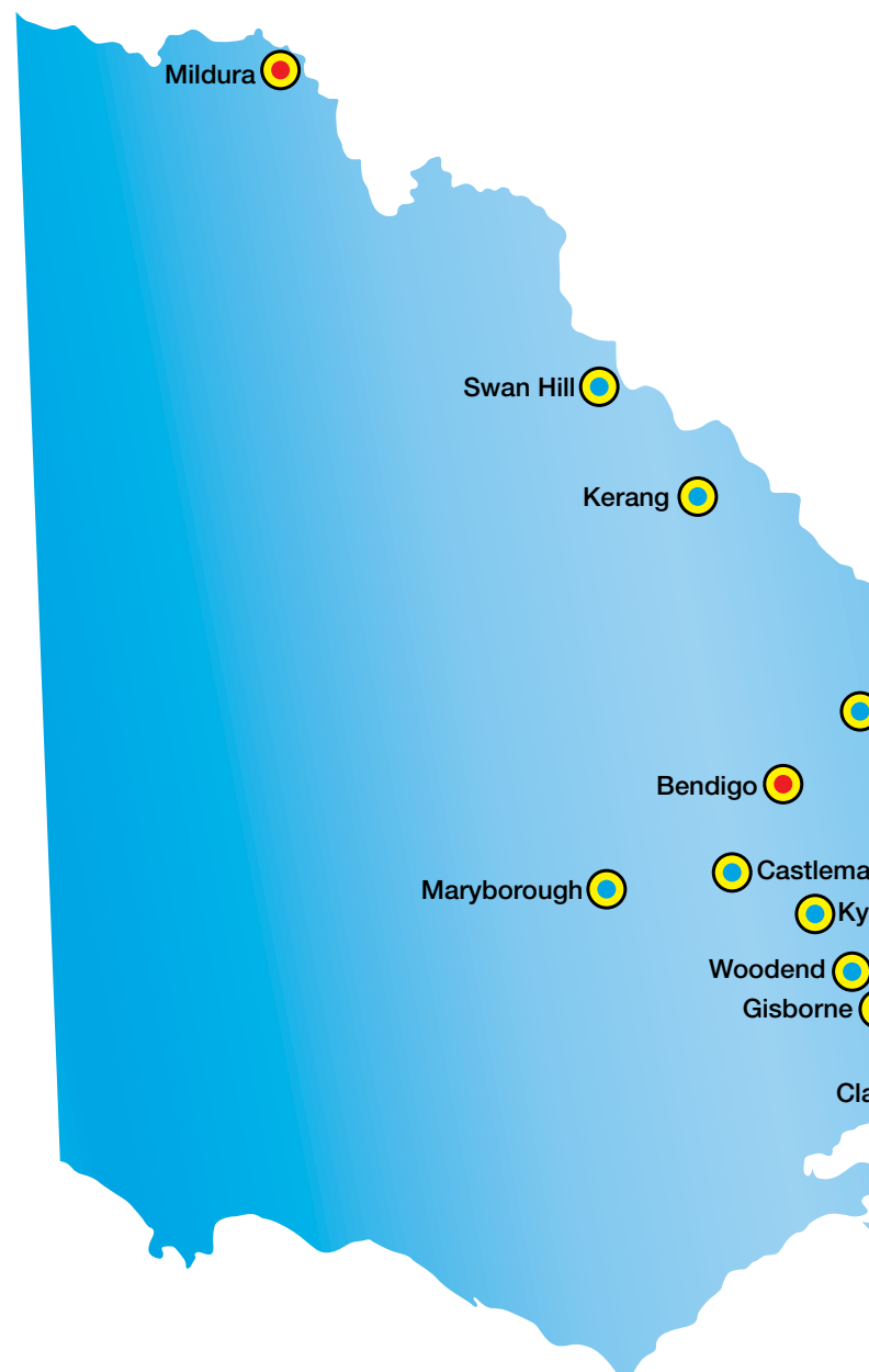
Monash Rural Health has sites and partners across north-west Victoria and Gippsland