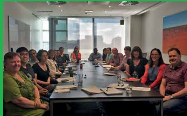
Members of the MABEL research team

Medicine in Australia: Balance Employment and Life