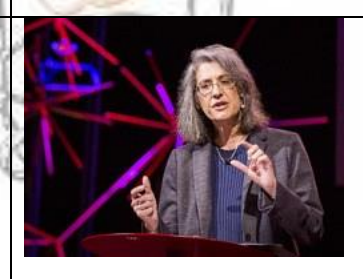
Elyn Saks A tale of mental illness — from the inside